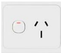
turn on toasty machine