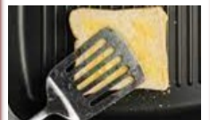
use fish slice to remove from machine