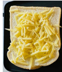
put cheese on bread