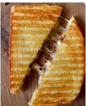
cut in half