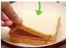
put the other piece of bread on top