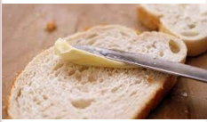
Spread margarine on bread